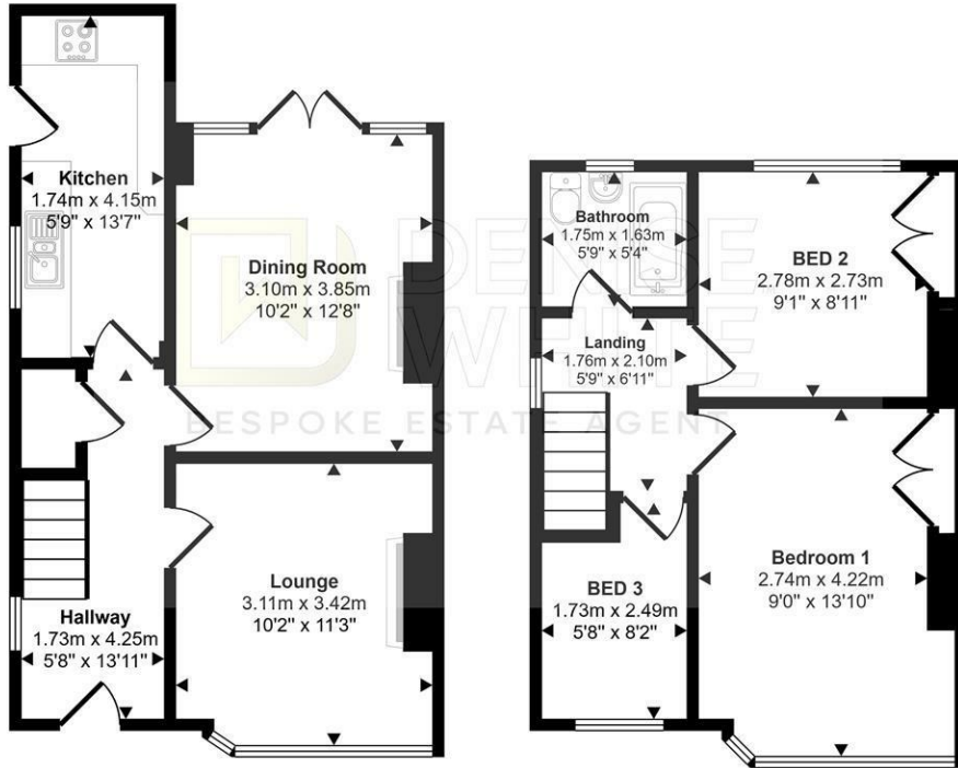
Ground Floor Approx 39 sq m / 418 sq ft

Approx Gross Internal Area 73 sq m / 783 sq ft